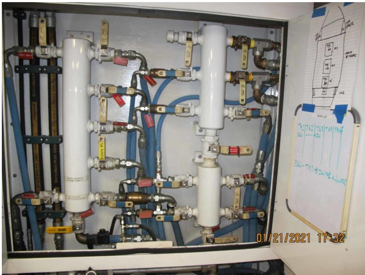
Fuel Manifold Cabinet