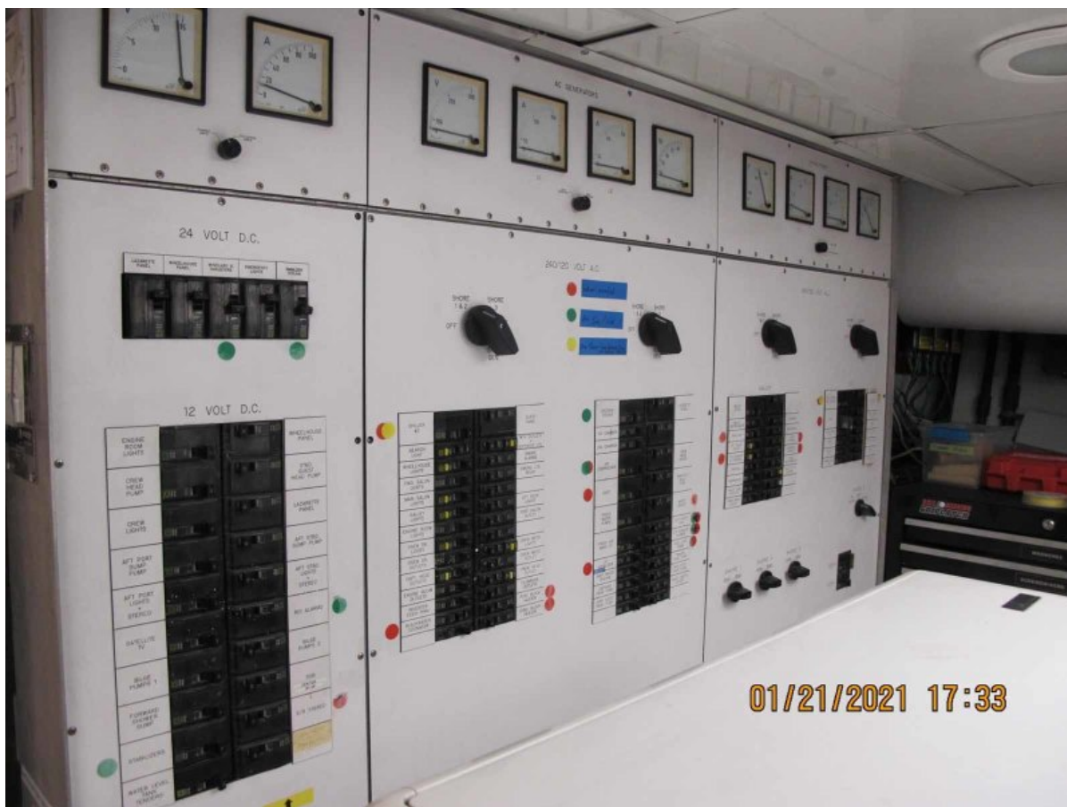
Main Ship's Panel