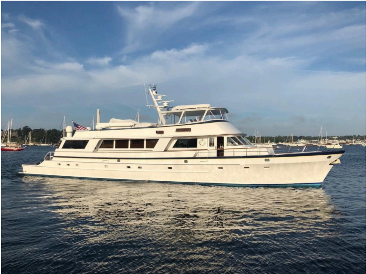
BANYAN, 102' Palmer Johnson