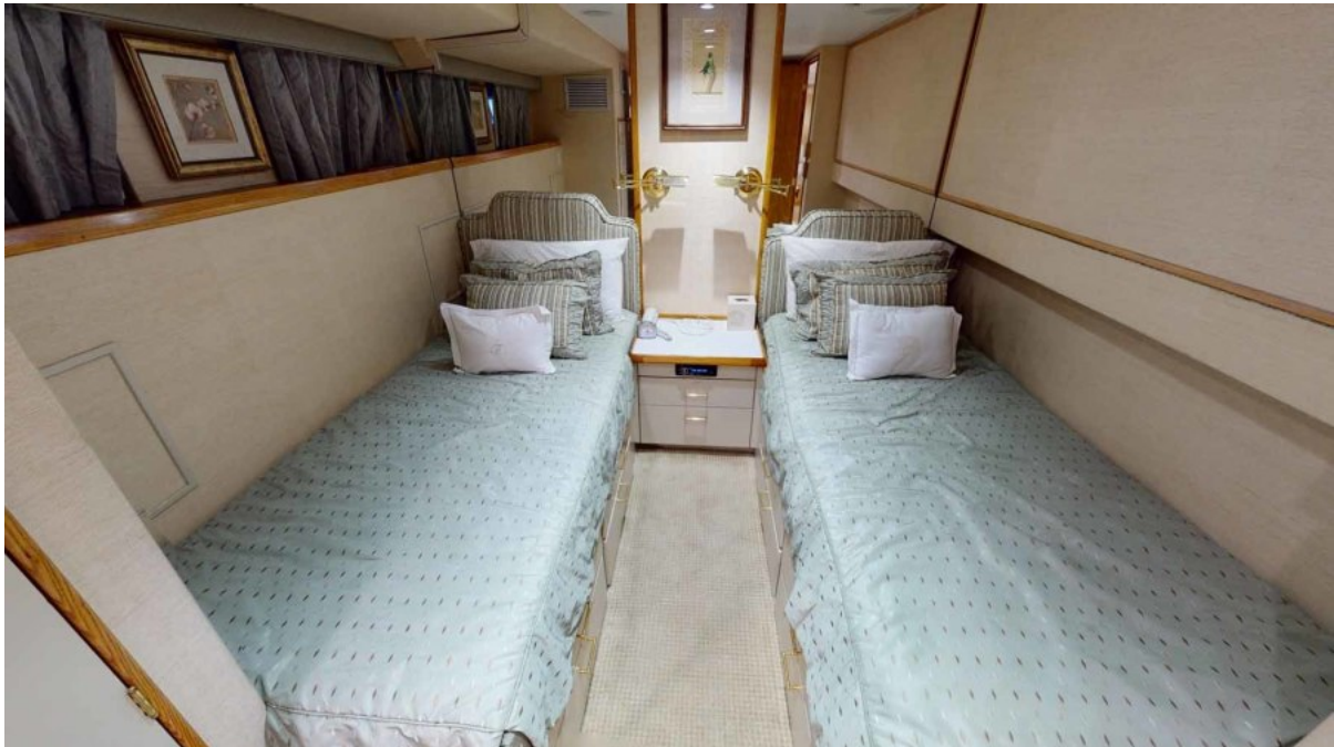
Portside Twin Cabin