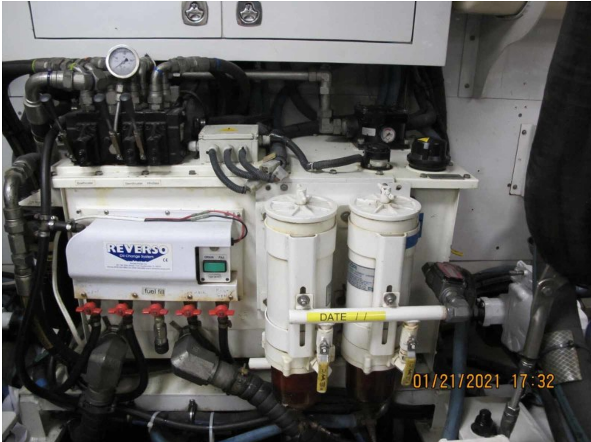
Hydraulic and Fuel Polishing System