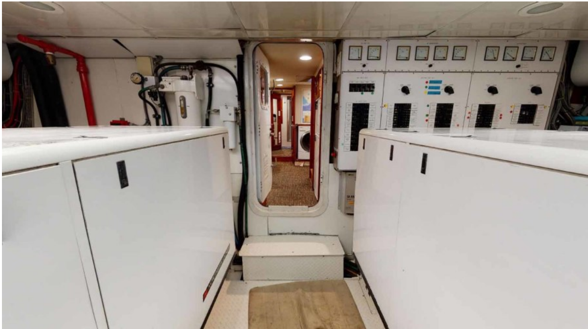
Engine Room Looking Forward