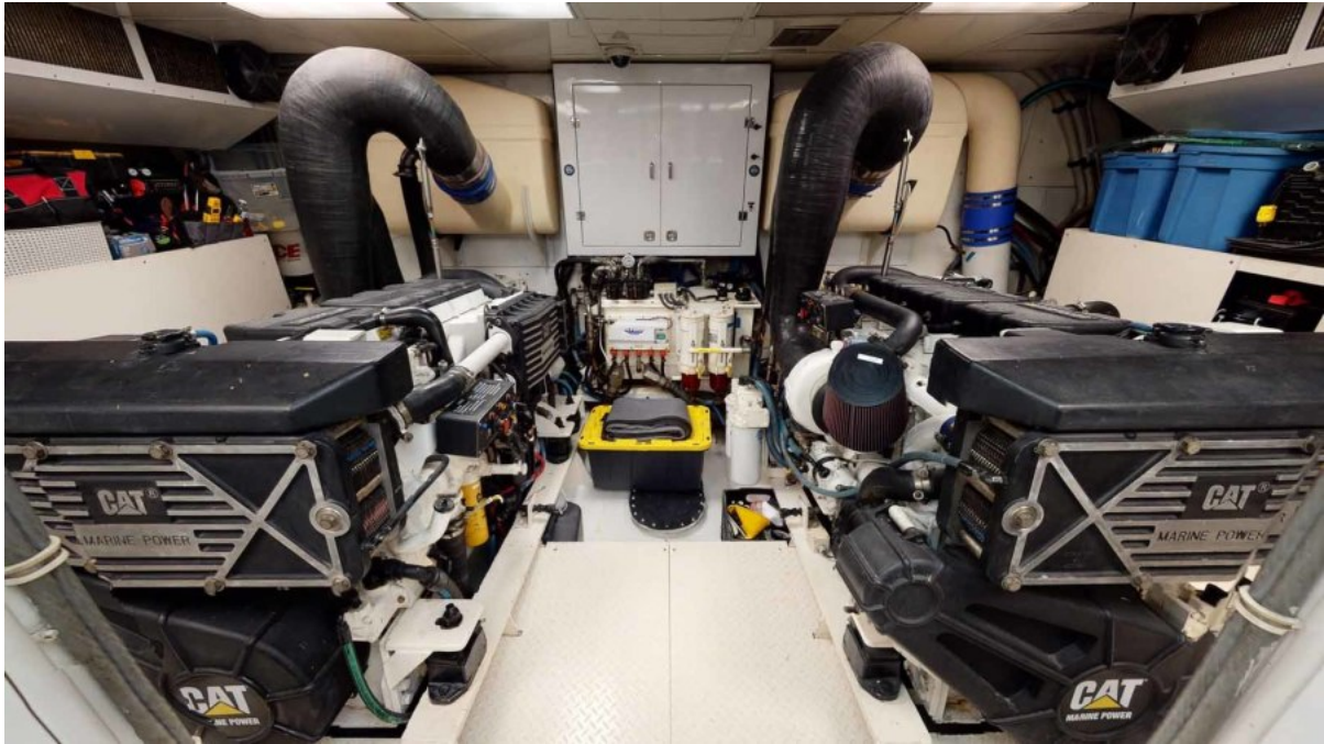
Engine Room Looking Aft