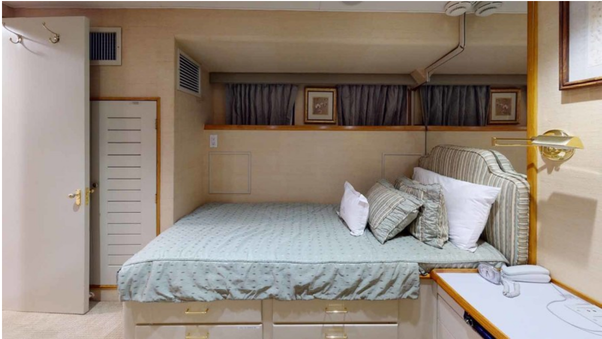
Outboard of Twin Berths