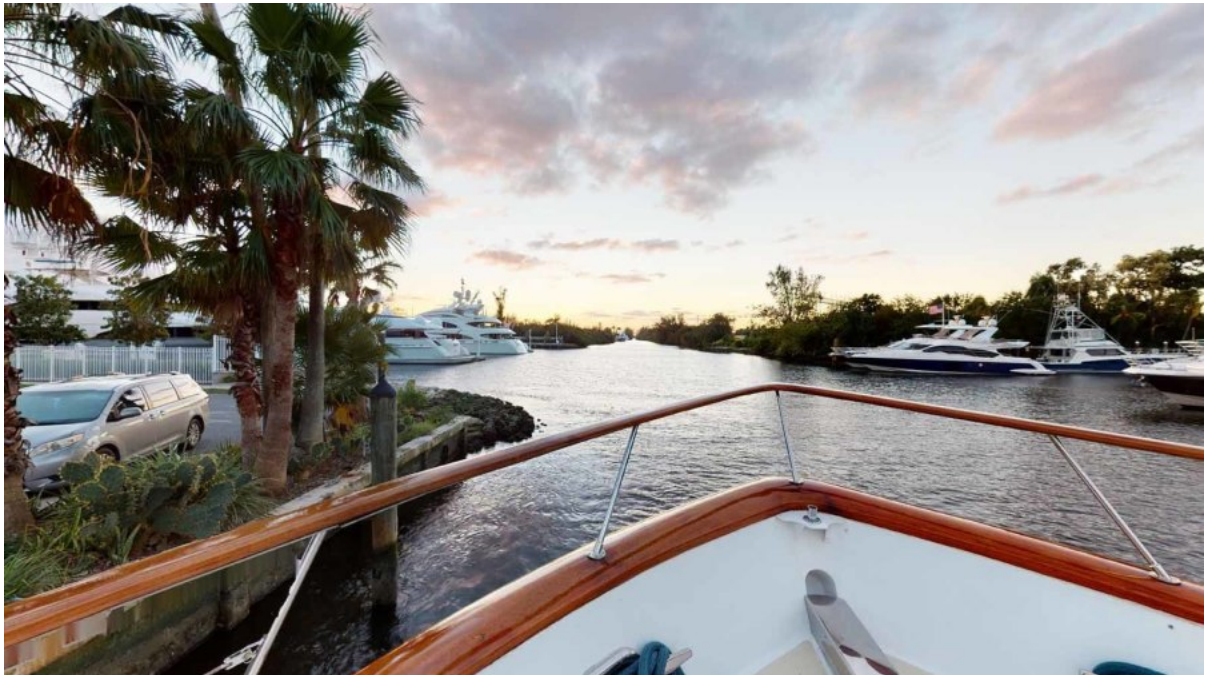
Varnished Cap and Handrails