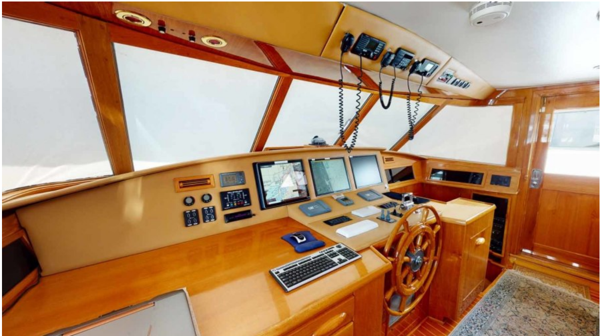
Helm Looking Starboard