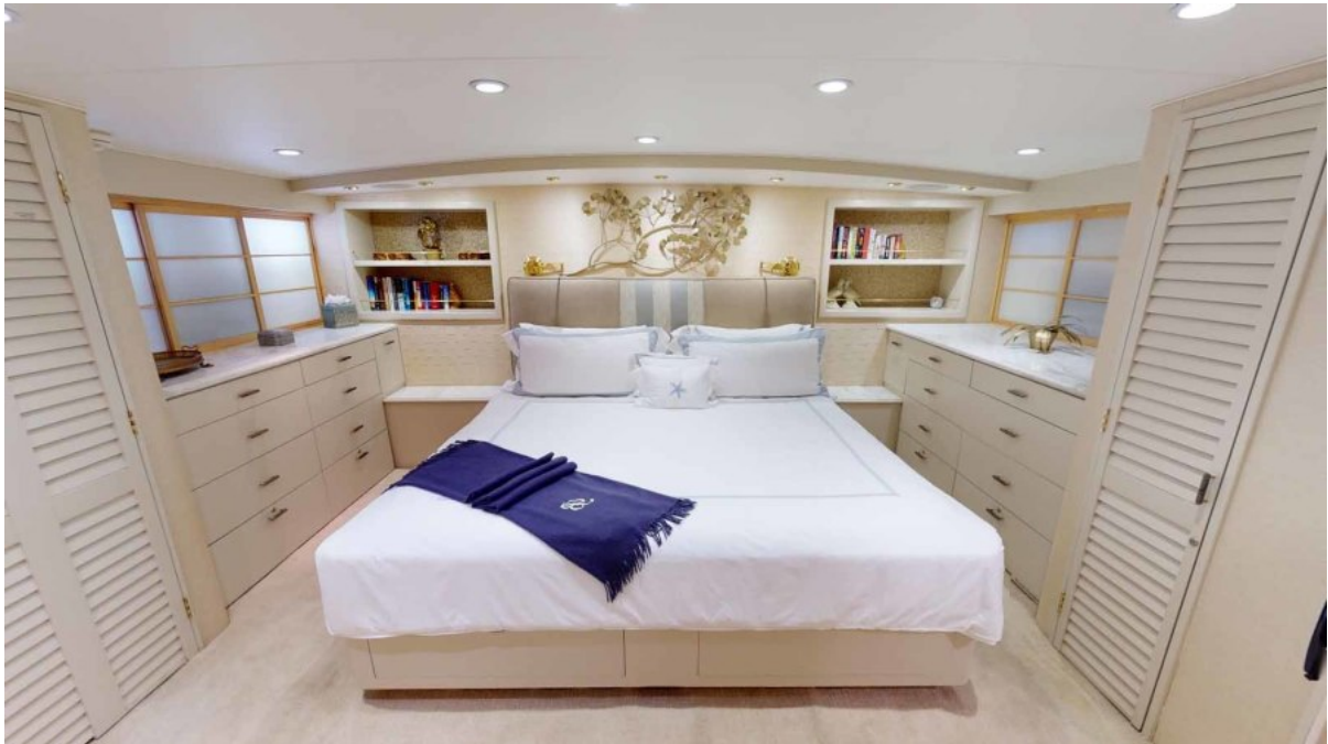
Master Looking Aft