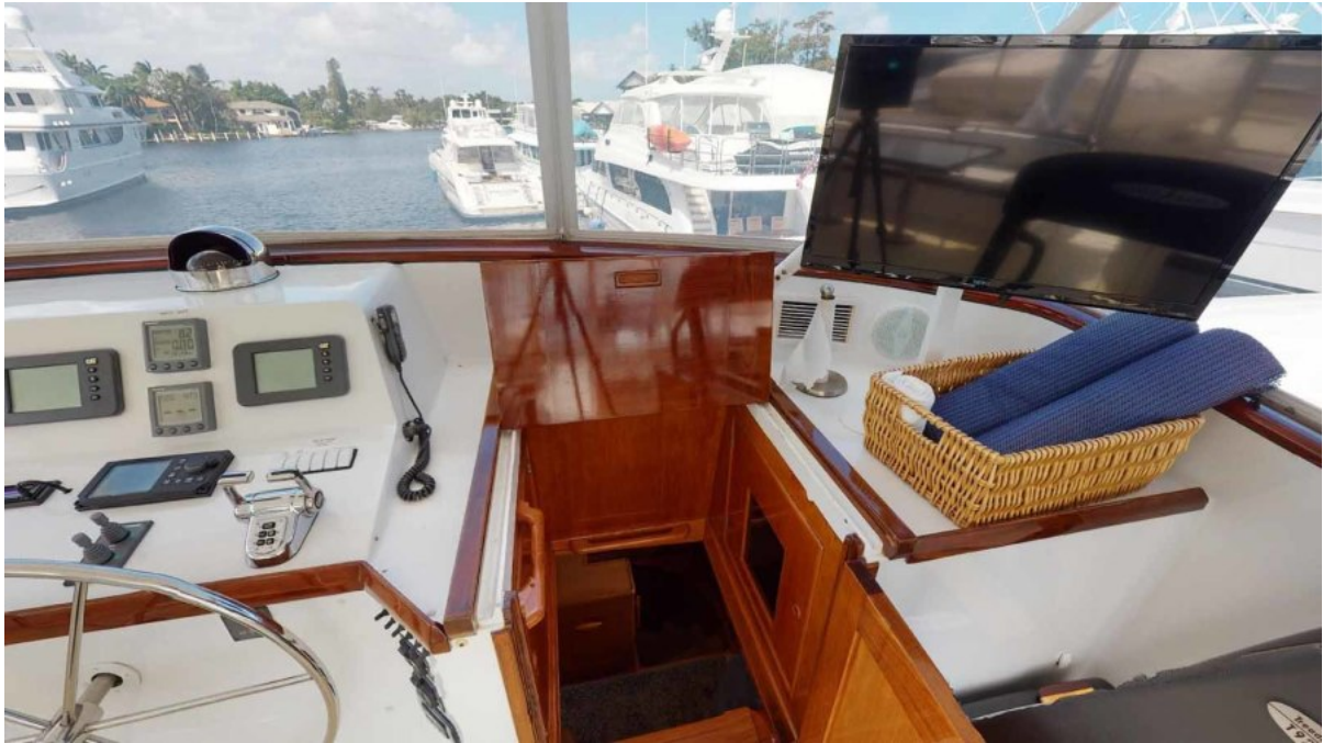
FB PH Stairs