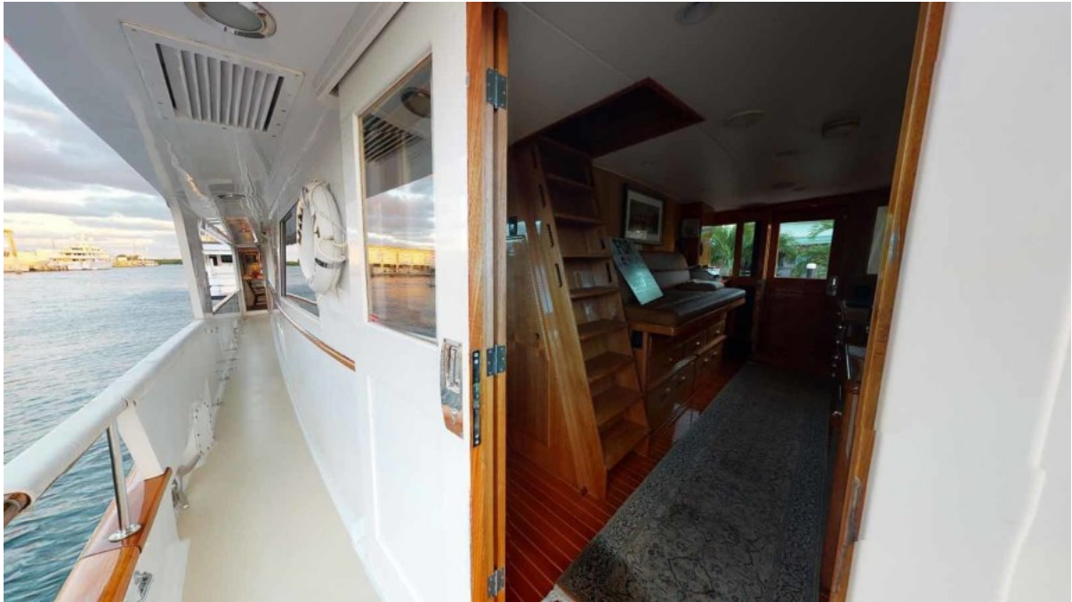
PH Doors to Side Deck