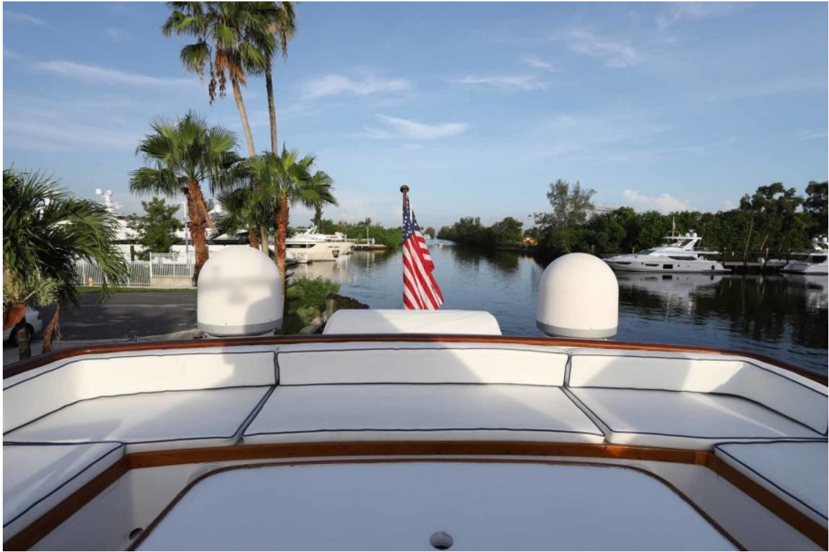
Boat Deck Seating