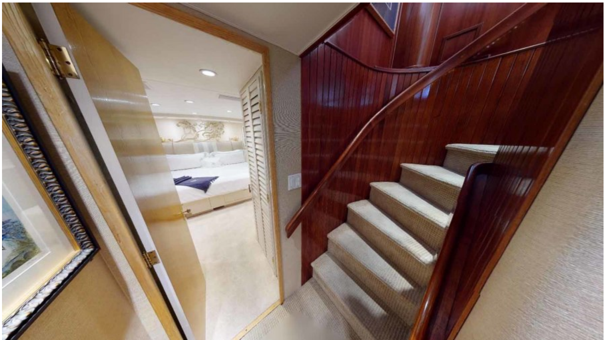
Companionway Stairs from Salon