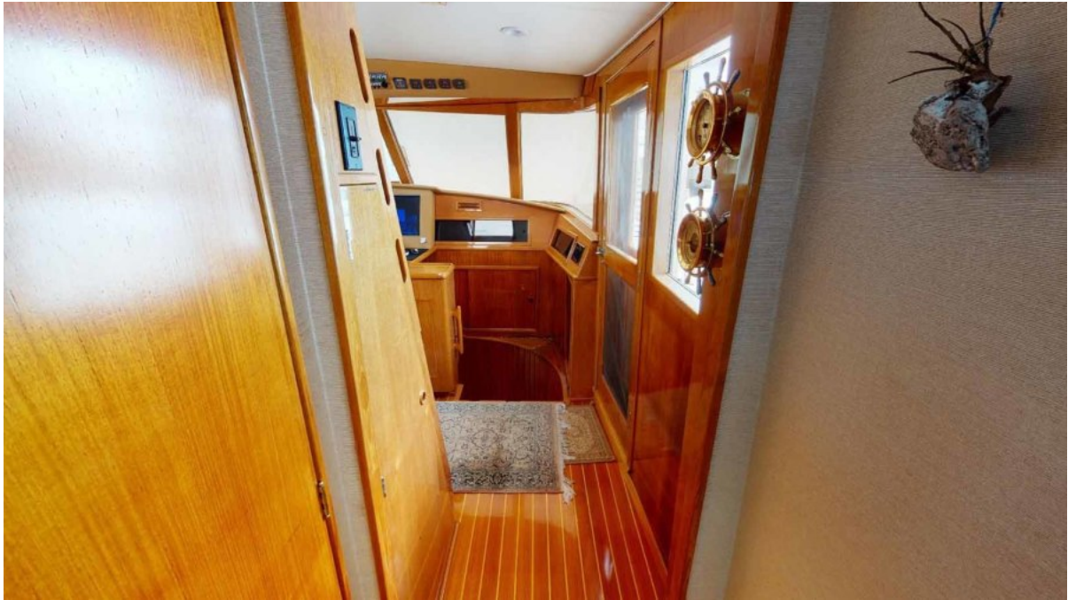
Companionway to Pilothouse