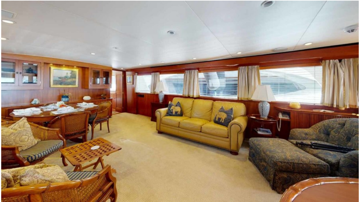
Salon Looking to Starboard