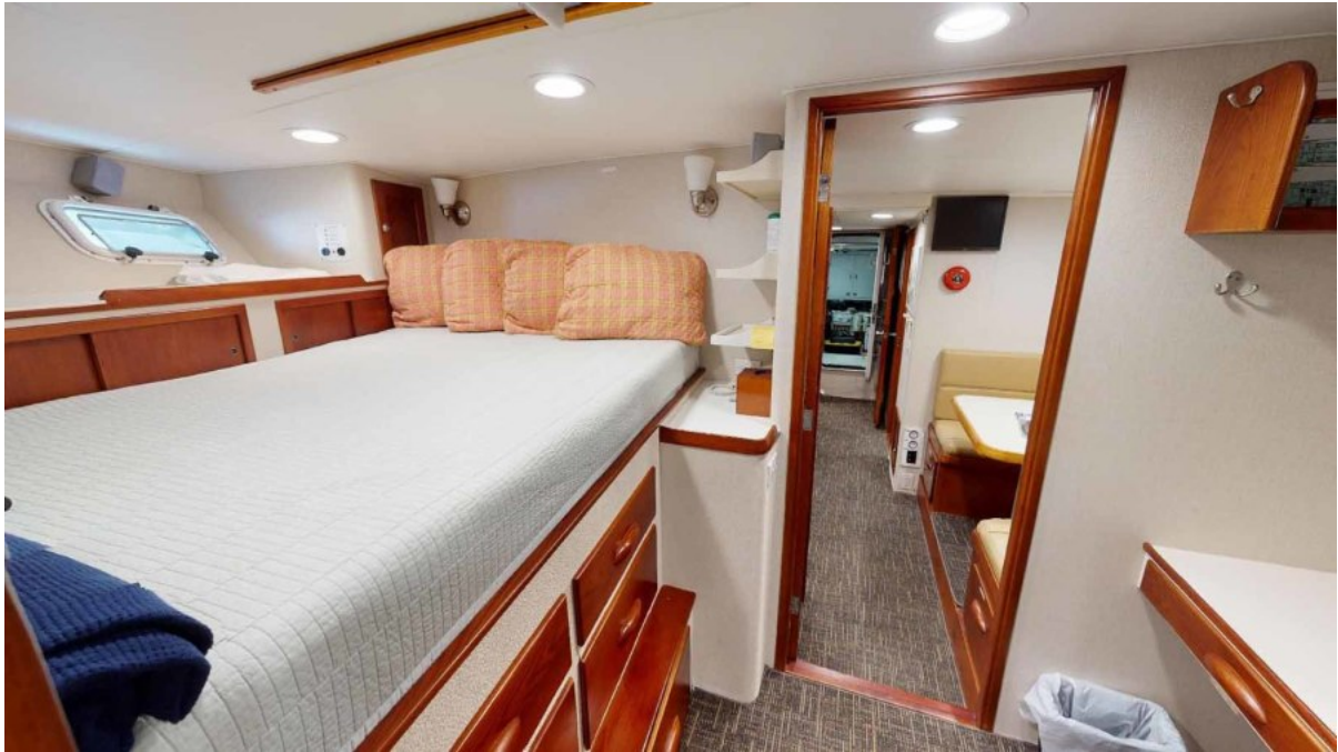
Capt Cabin Looking Aft