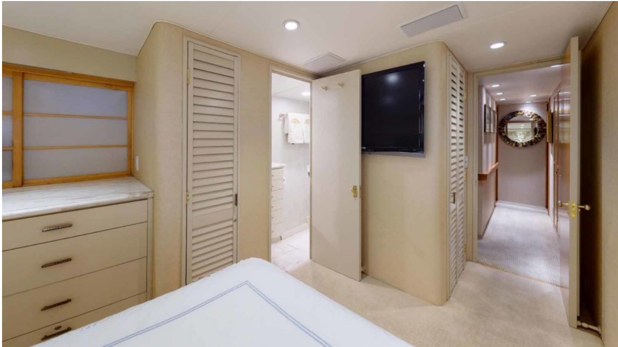
Master Looking Forward