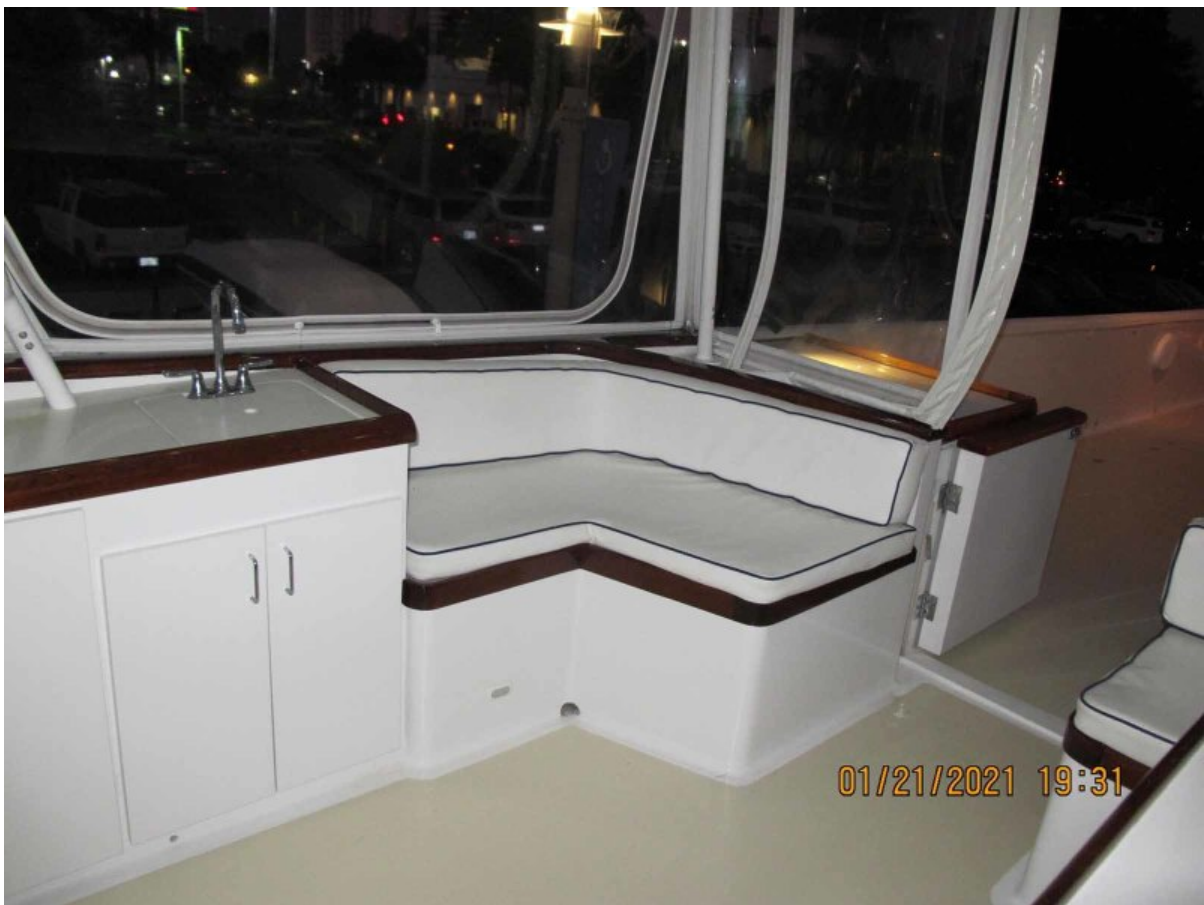
FB After Corner Seat