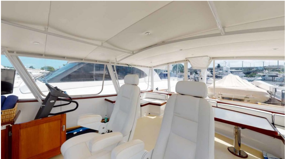
Helm Twin Seats