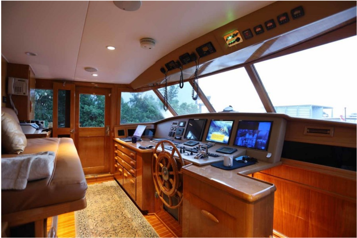
Helm Looking Port