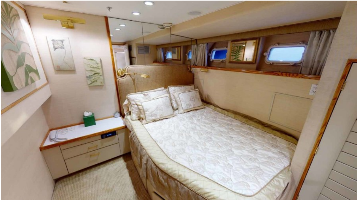
Starboard Side VIP