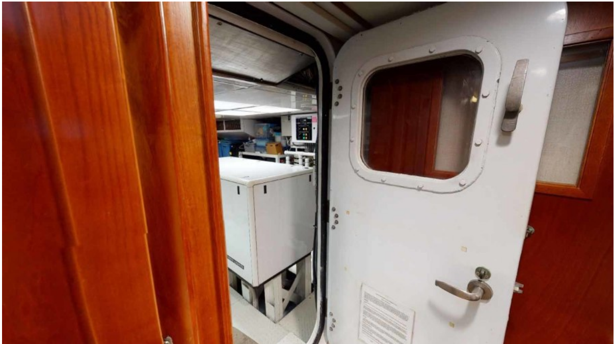
Engine Room Entrance