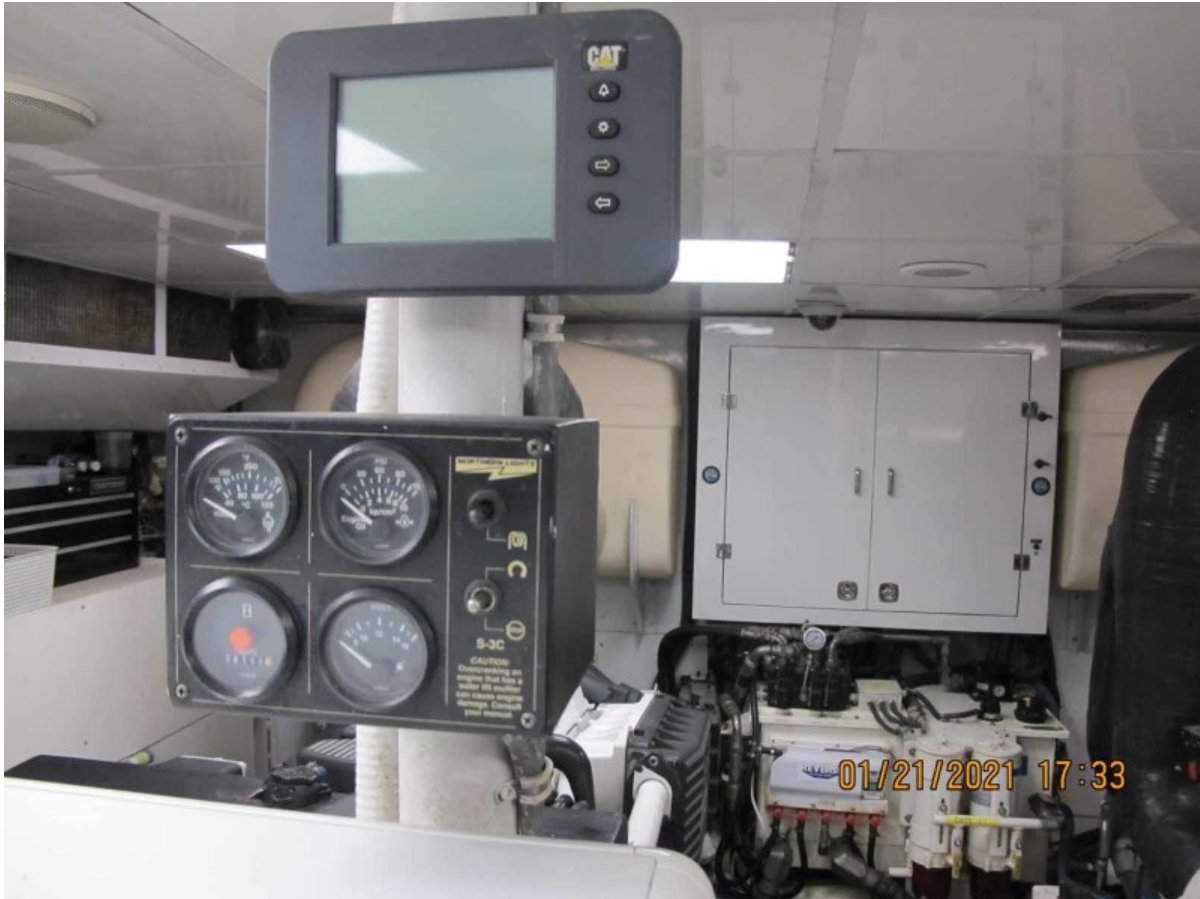
LCD CAT Panels in ER