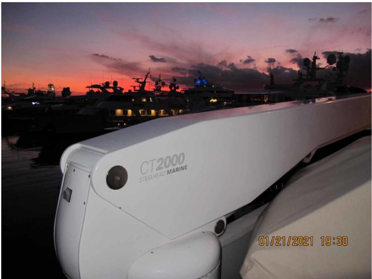
Boat Deck Crane