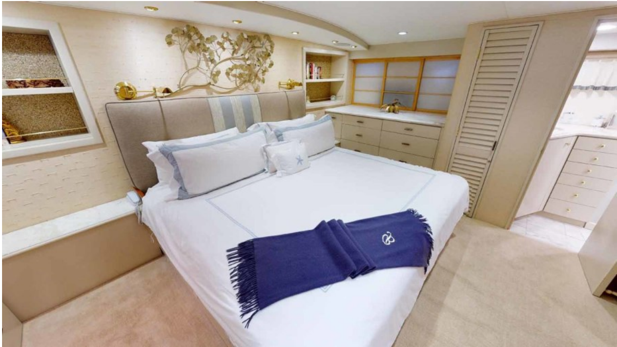
Master Looking to Port