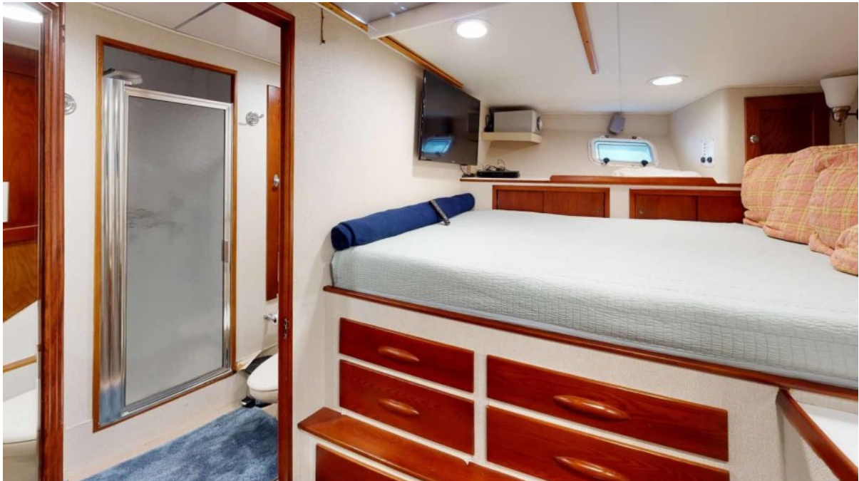
Capt Cabin Looking Forward