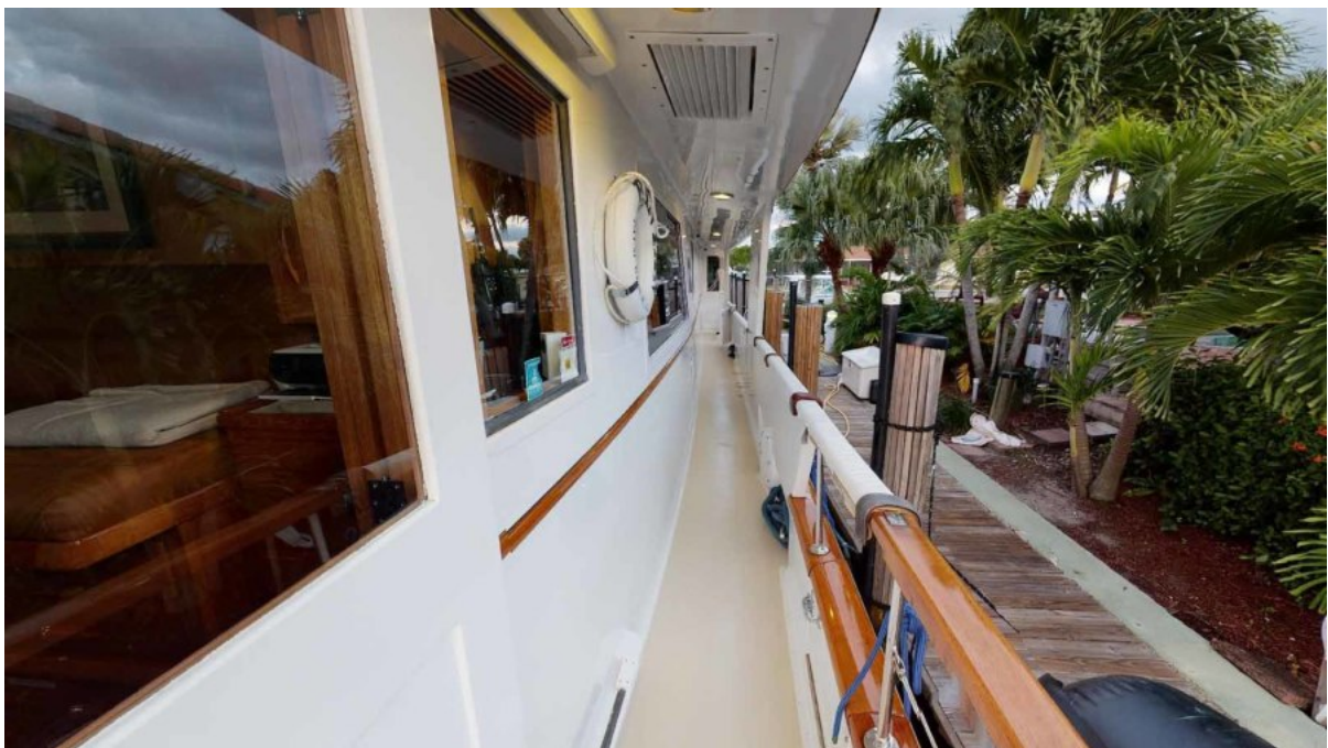
Wide Side Decks