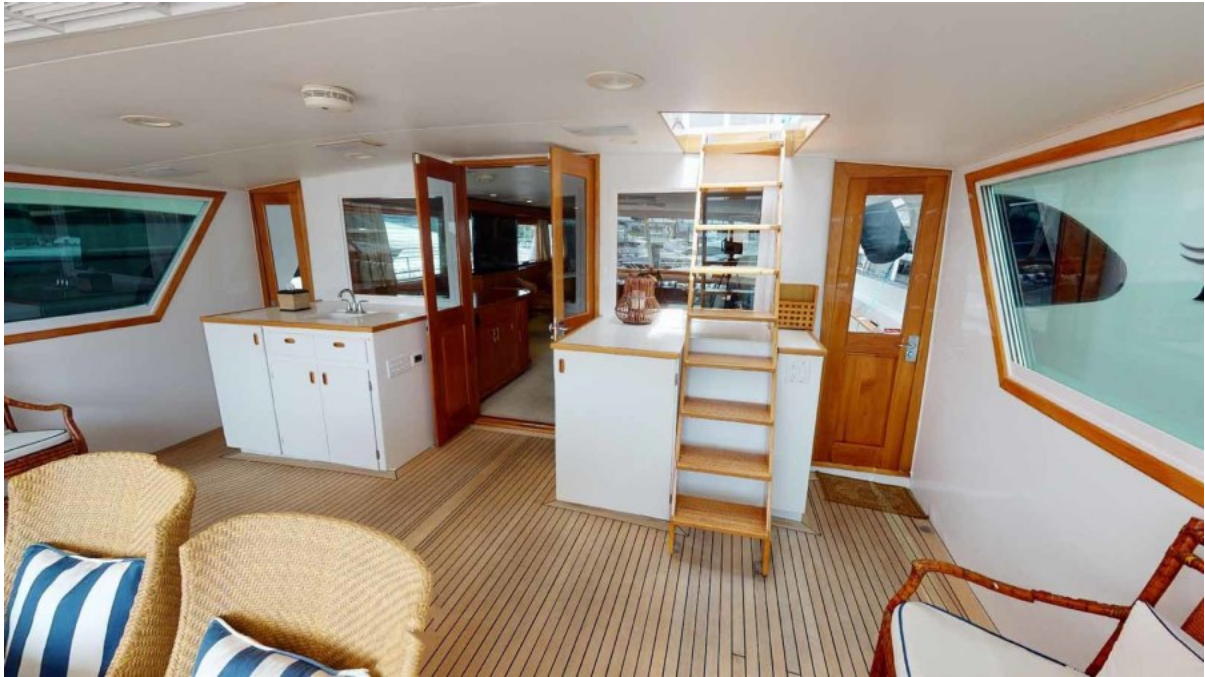
Aft Deck Looking Forward