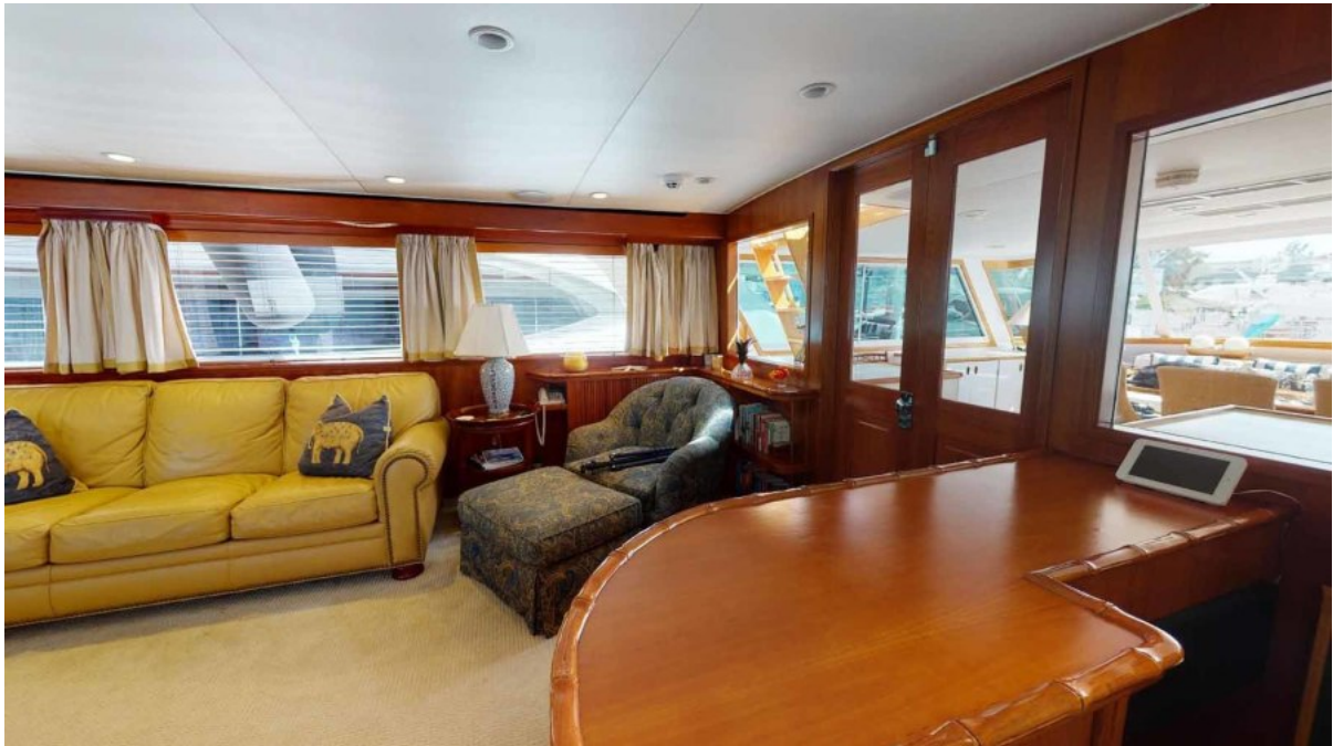
Salon Aft Corner