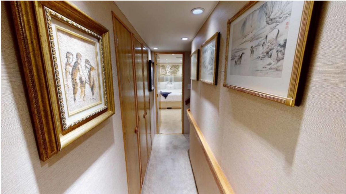
Lower Deck Companionway