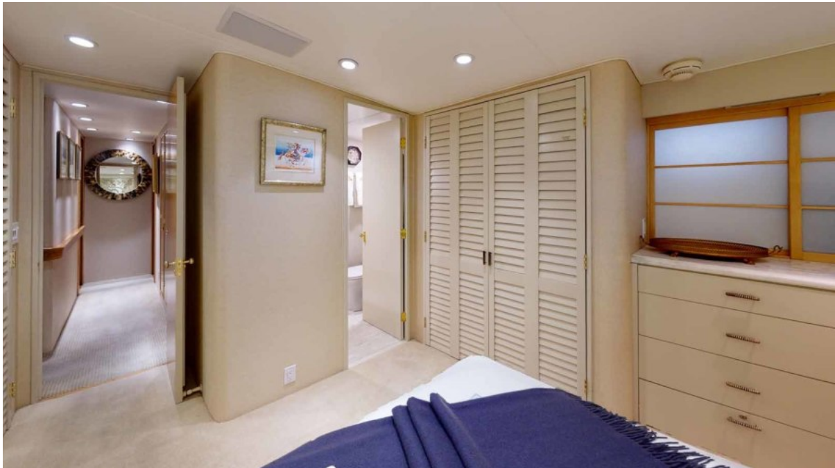
Master Looking to Starboard