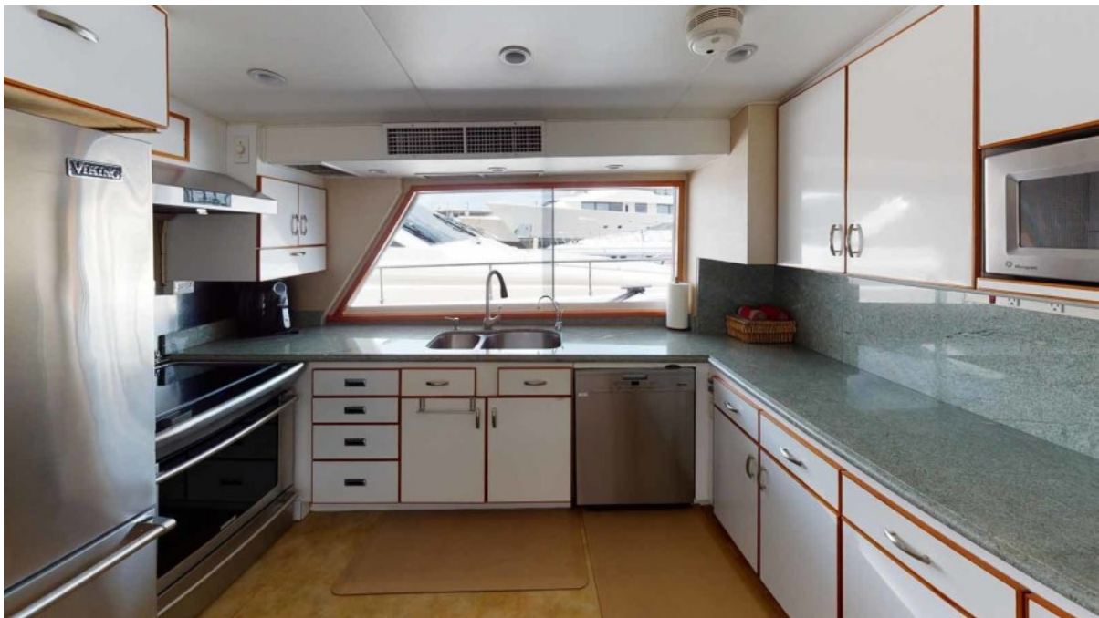
Galley from Companionway