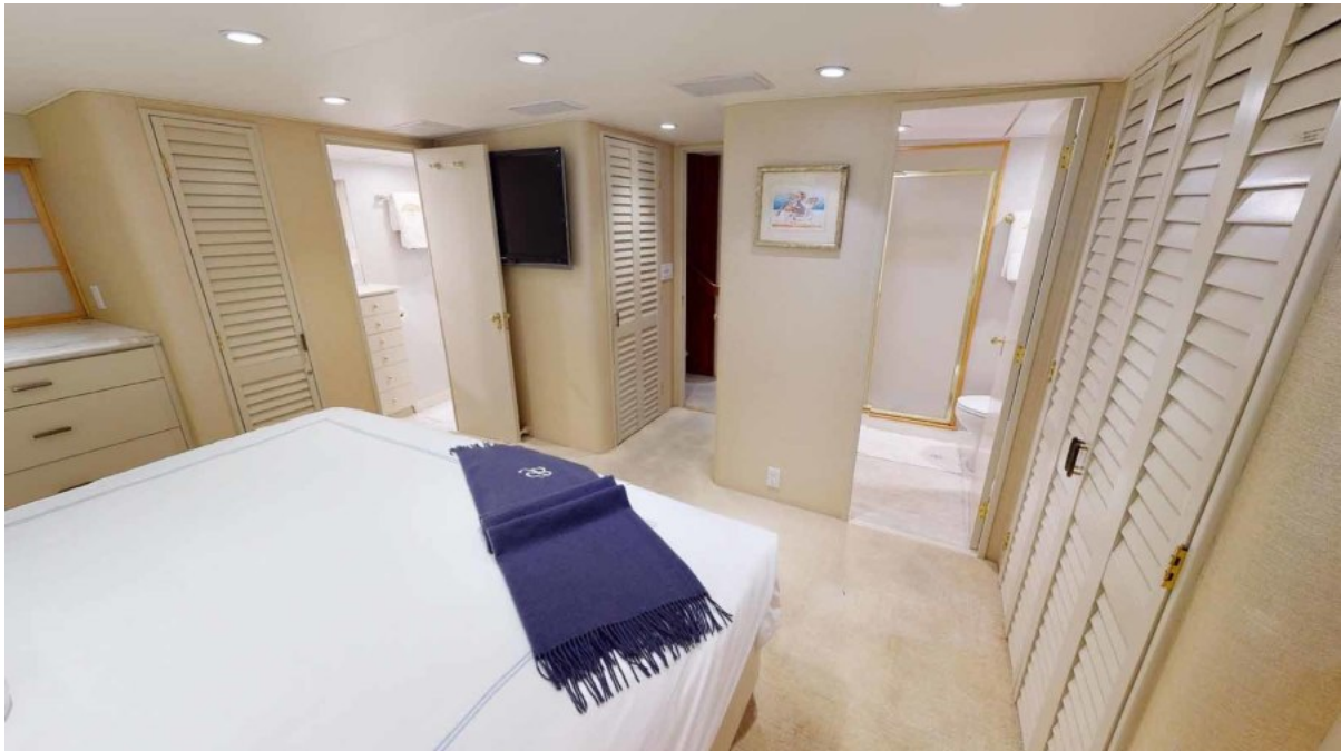
Master Looking Forward